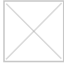
figure and the nature of the surprise unresolved, while underscoring June's growing unease with the Republic's power structures.